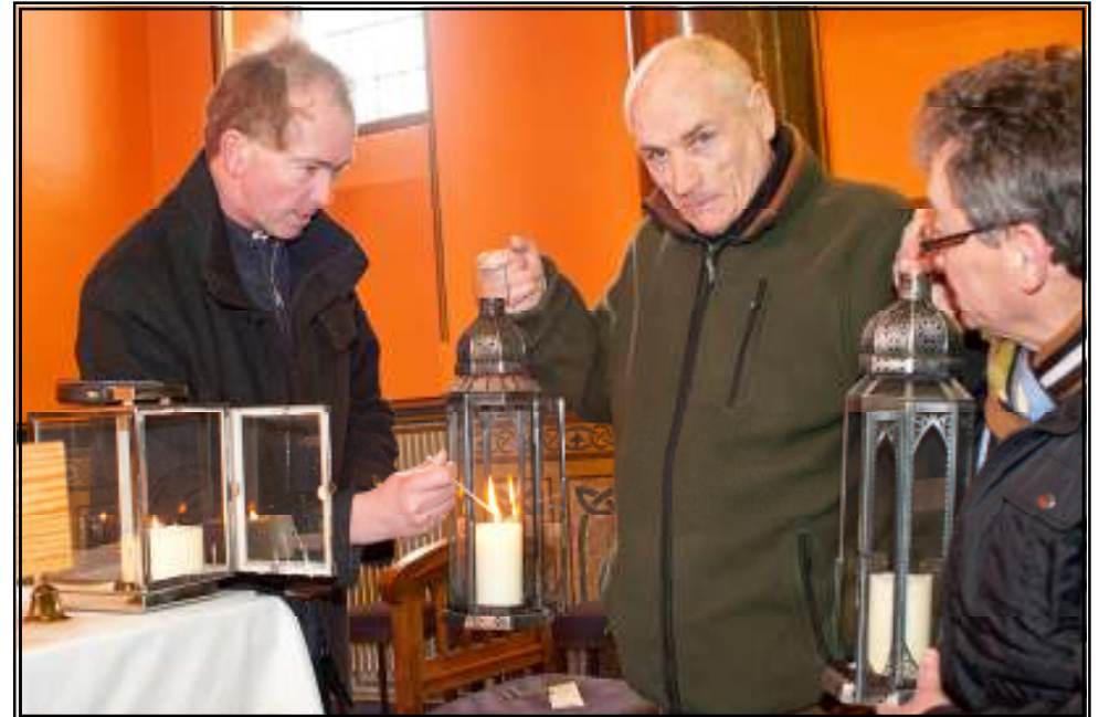
Lanterns lit for Faughanvale and Claudy